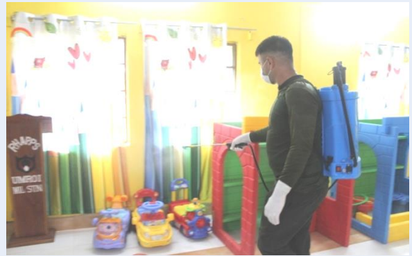
DISINFECTION AND CLEANING OF CLASSROOMS