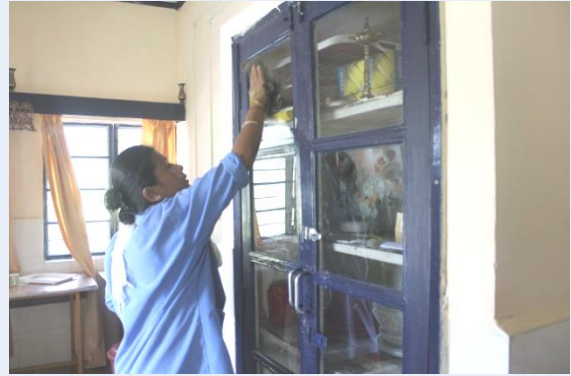
CLEANING OF KITCHEN