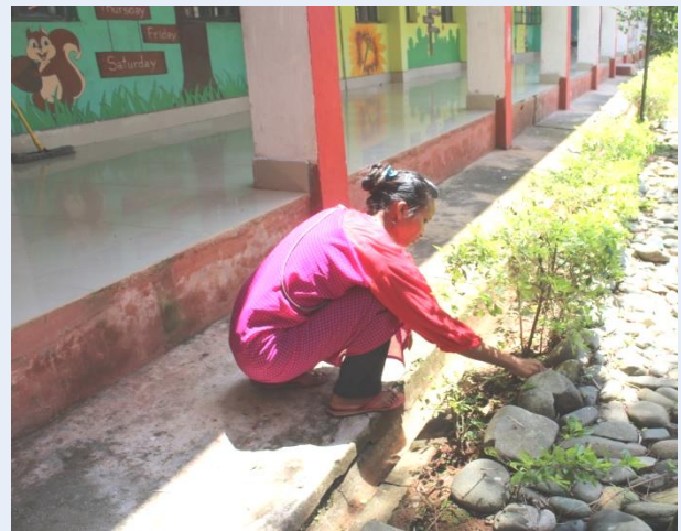
CLEARING BUSHES INSIDE THE SCHOOL CAMPUS