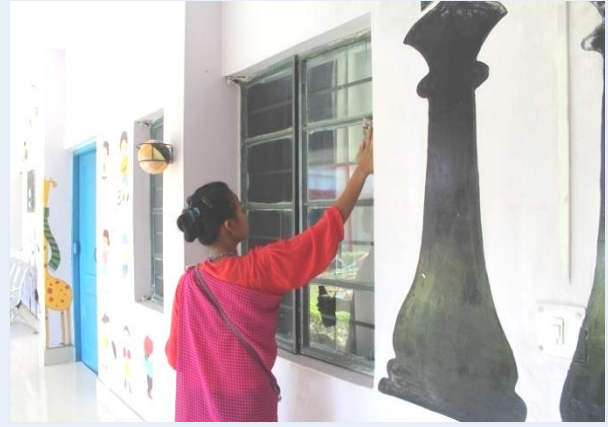
CLEANING OF WINDOWS