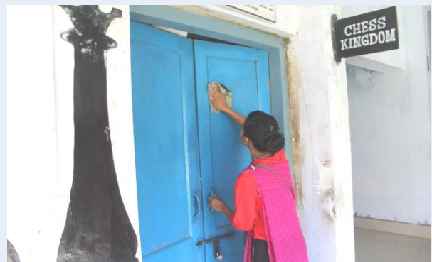
CLEANING OF DOORS