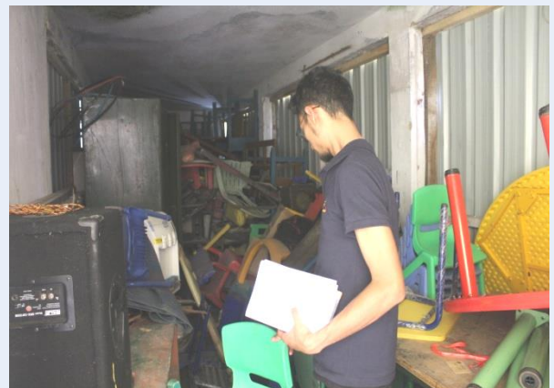
INSPECTION OF BROKEN FURNITURE BY OVERALL INCHARGES