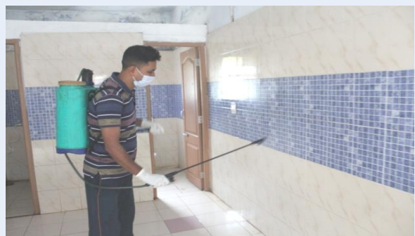
DISINFECTION OF TOILETS