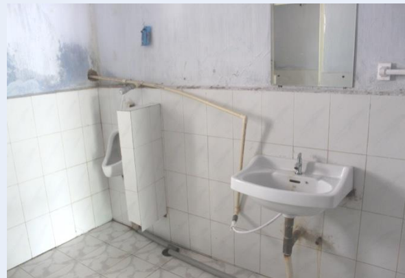
CHECKING AND REVIEW FOR PIPED WATER SUPPLY CONNECTION