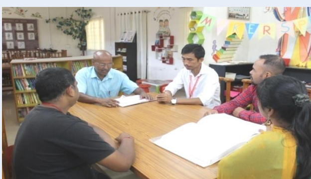
MEETING OF SENIOR TEACHERS